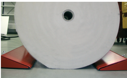
Utilising the built-in lifting device reels and drums of varying sizes can be handled without any additional assistance.

Solving's air film Mover provides high standards of safety for both personnel and products. The air film Mover requires minimum maintenance and is a cost-effective solution to material handling needs.