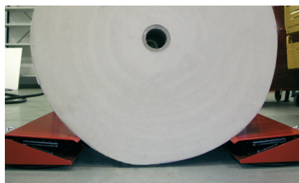
Air bearings lift the loaded Mover from the floor and a thin film of air is formed on which the Mover floats, virtually without friction.